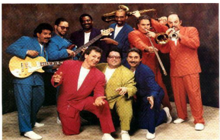
Randy & The Rainbows