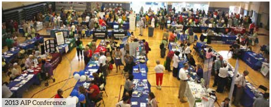
2013 AIP Conference