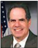
Receiver of Taxes Charles Berman

Call 311 or visit www.northhempsteadny.gov for more Town information.