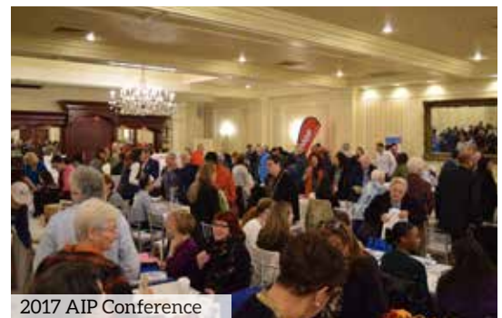
2017 AIP Conference