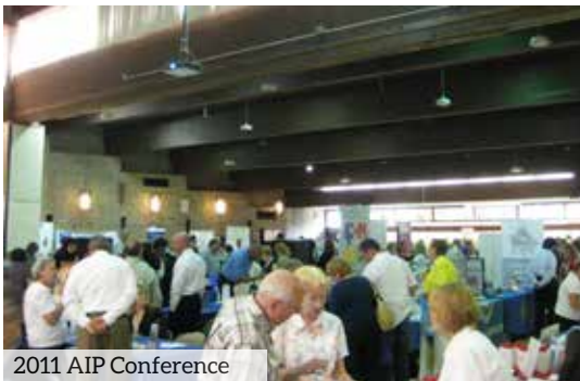
2011 AIP Conference