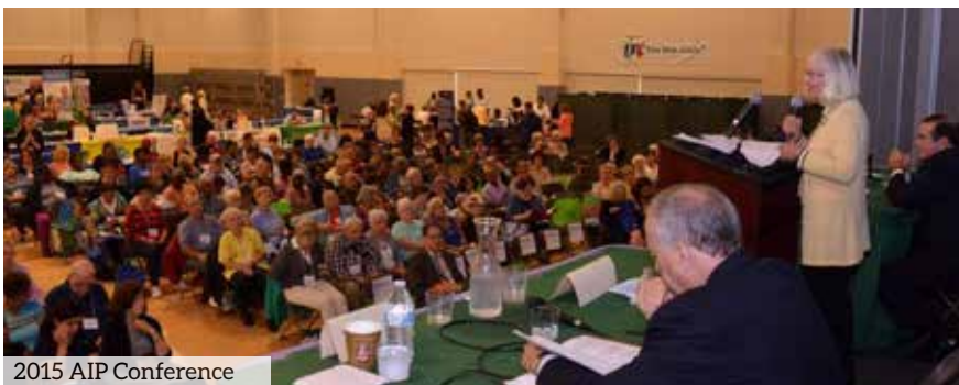
2015 AIP Conference